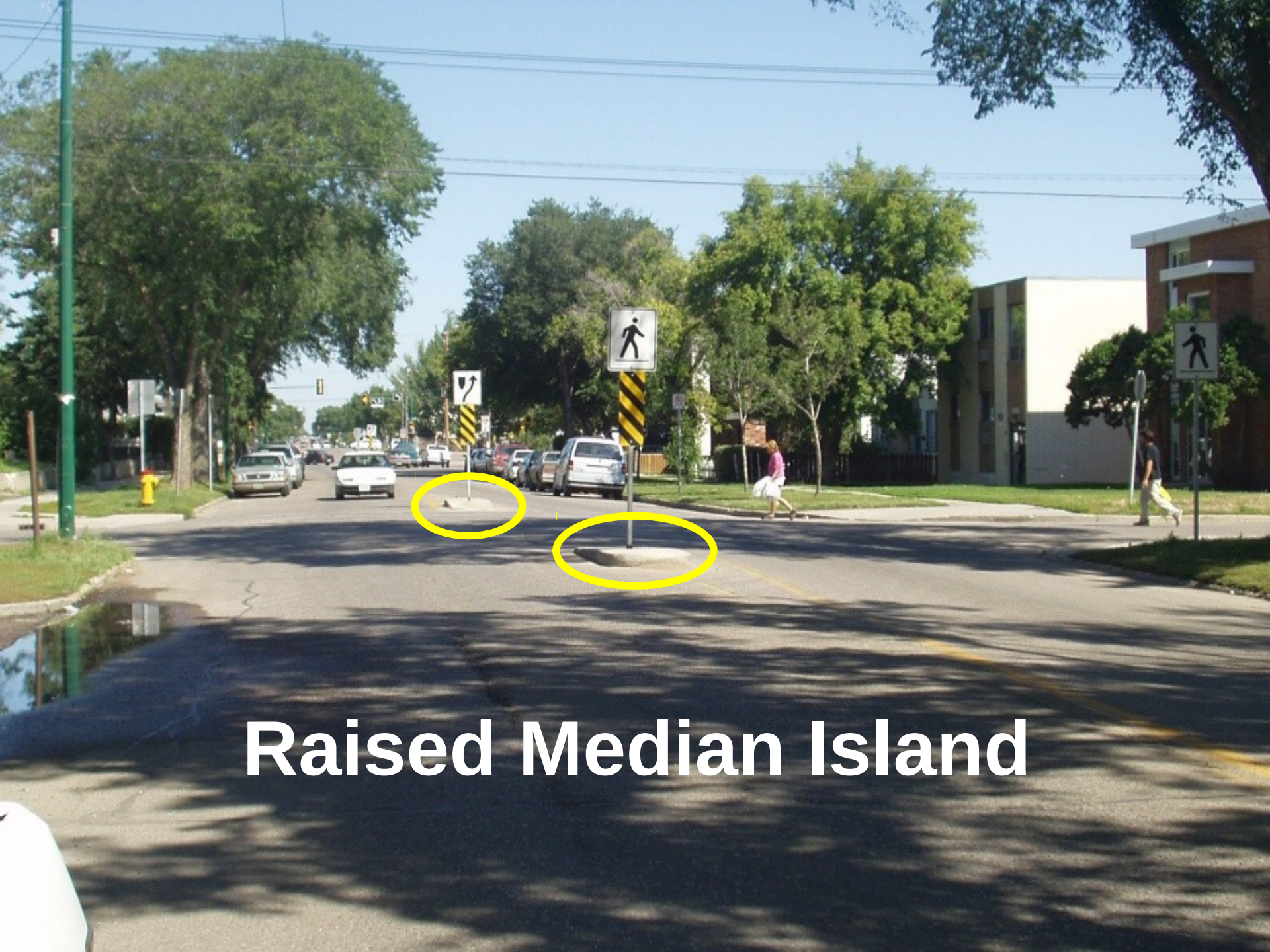
Raised Median Island